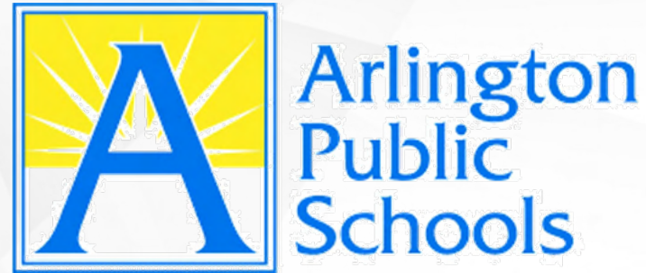
Arlington County School District