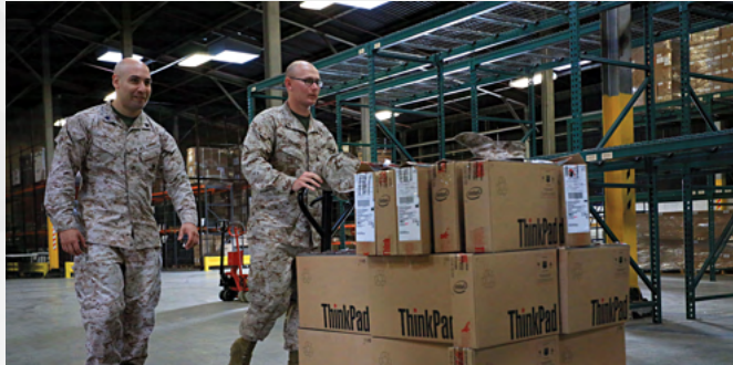
Marine Corps Albany 5G Smart Warehouse